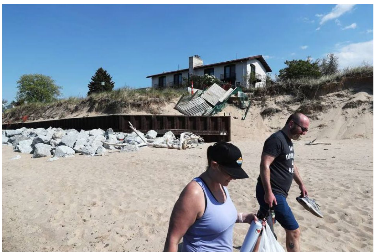
Beachgoers walk past boulders, an exposed retaining wall, and a damaged walking path on Ogden Dunes Beach at Ogden Dunes in Portage Township, Ind., on Friday, May 14, 2021. Erosion in recent years required the placement of boulders along the beach in 2020 to protect homes, but more beachfront has appeared in 2021.

A little more than three years ago, Lake Michigan was at its highest level in more than 30 years, and waves dashed up against the sheet steel piling that lakefront homeowners in the town of Ogden Dunes had installed in the 1980s and 1990s.